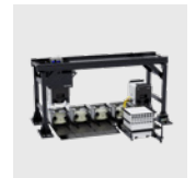
PRO500 Multiprocess System