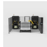
PRO500 Automated Cell